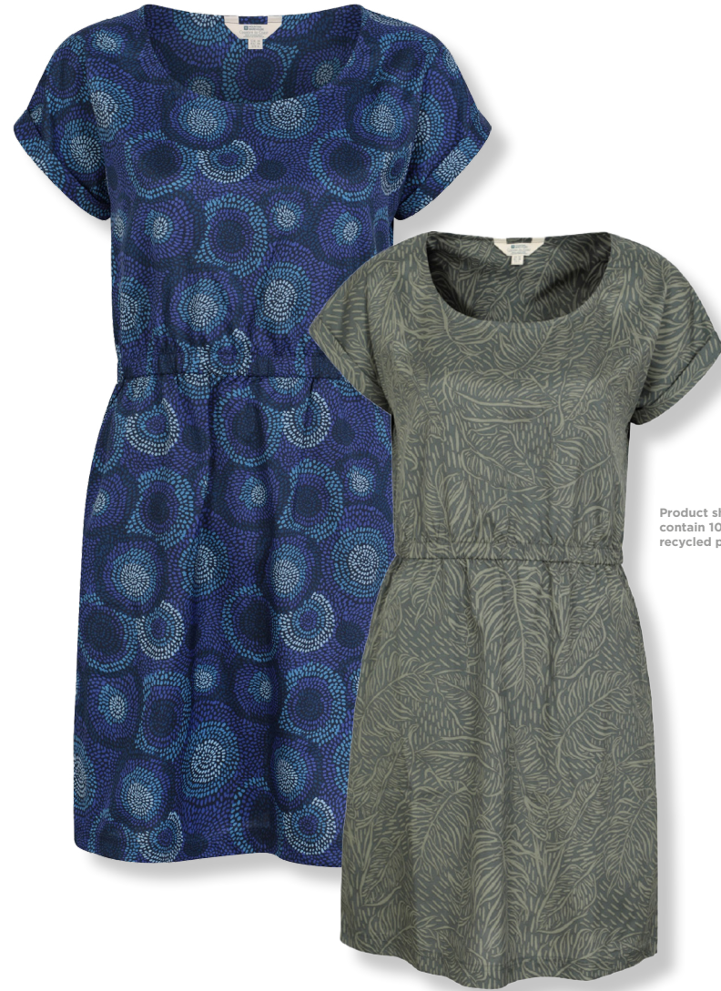
Product shown contain 100% recycled polyester

Our suppliers source the recycled fabric on our behalf and provide us with factory scope and transaction certificates for the finished product as proof of claim.