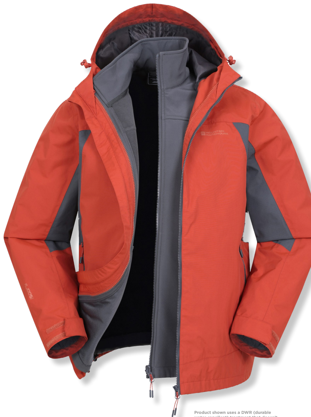
Product shown uses a DWR (durable water-repellent) treatment that doesn't contain PFCs (Perfluorinated chemicals)

Where it is not possible for the fabric to be naturally UV, we use treatments to deliver the UV properties, we nominate the chemical supplier and treatment restricting the options to treatments that are approved for use with organic/ recycled material certification schemes.