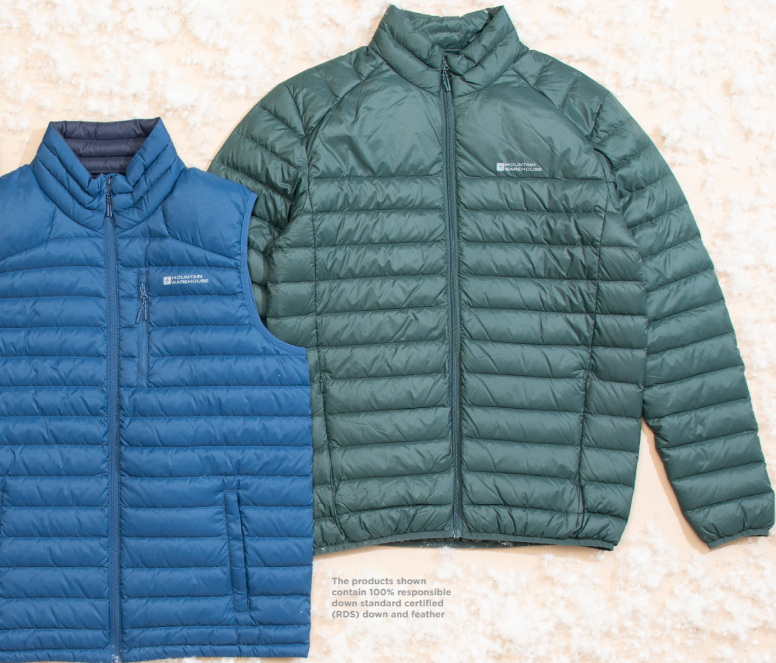
The products shown contain 100% responsible down standard certified (RDS) down and feather

Our down and feathers supply chain is certified to the Responsible Down Standard (RDS).